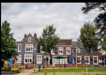
RGS The Grange Grange Lane, Claines WR3 7RR Independent Education for children aged 2 - 11