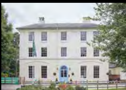
RGS Springfield Britannia Square, Worcester WR1 3DL Independent Education for children aged 2 - 11