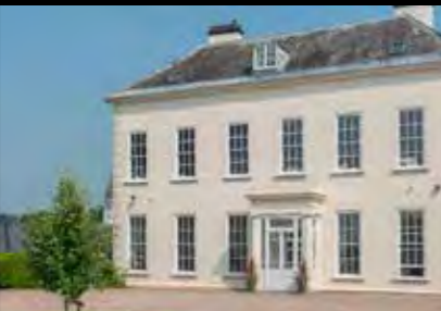
RGS Dodderhill Dodderhill Road, Droitwich Spa WR9 0BE Independent Education for children aged 2 - 11 Girls only education for 11-16 years