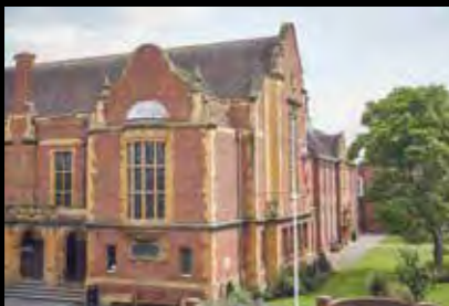
RGS Worcester Upper Tything, Worcester WR1 1HP Independent Education for children aged 11 - 18

Find out more about the outstanding education, incredible opportunities and lifelong memories our schools provide www.rgsw.org.uk